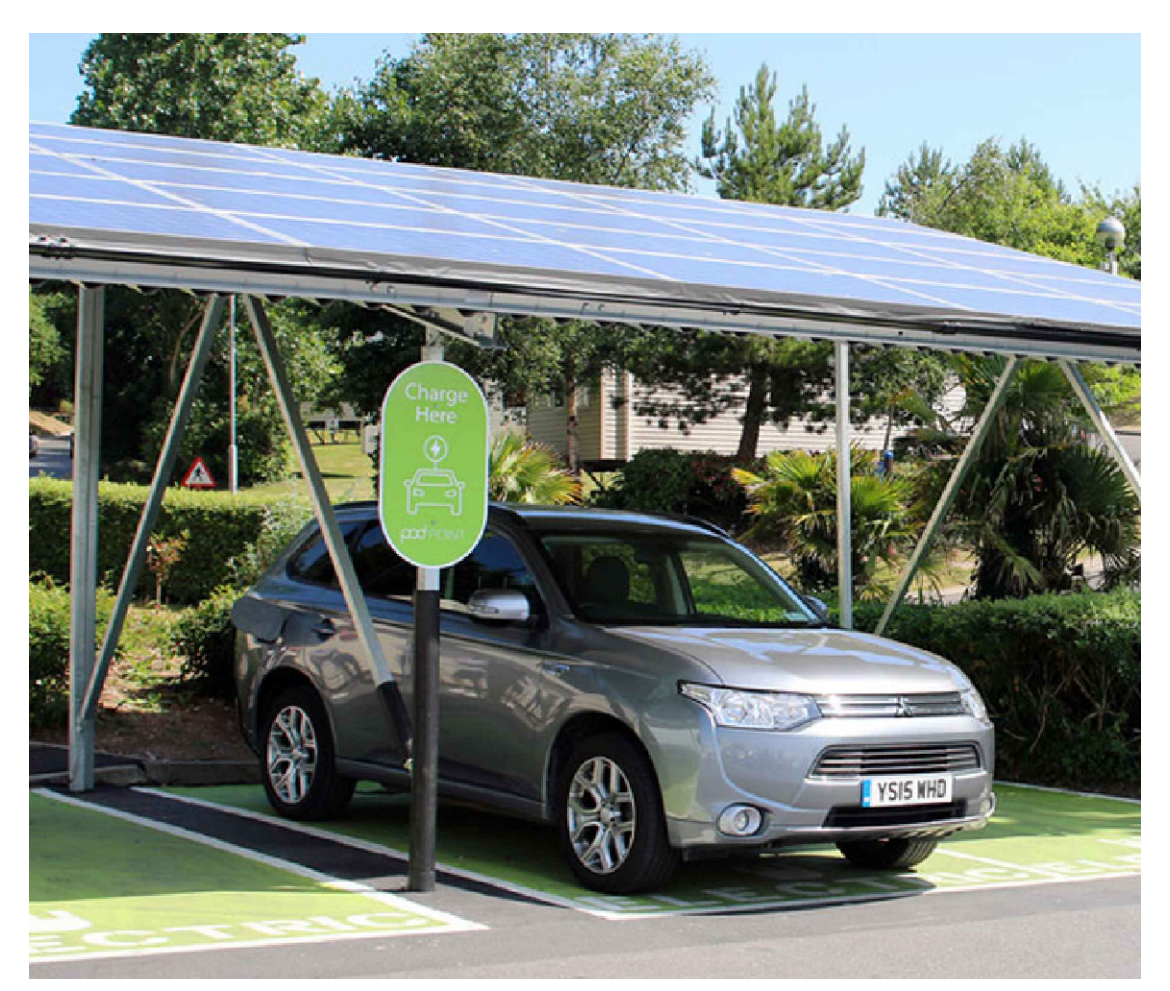
CAR PORT MOUNTED PV SOLAR PANELS