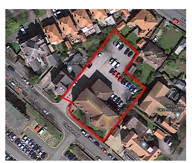
FIGURE 2.1 THE SURVEYED SITE IS SHOWN OUTLINED IN RED.