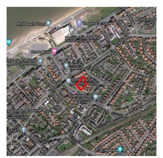
FIGURE 2.2 THE SURROUNDING AREA OF THE SITE.