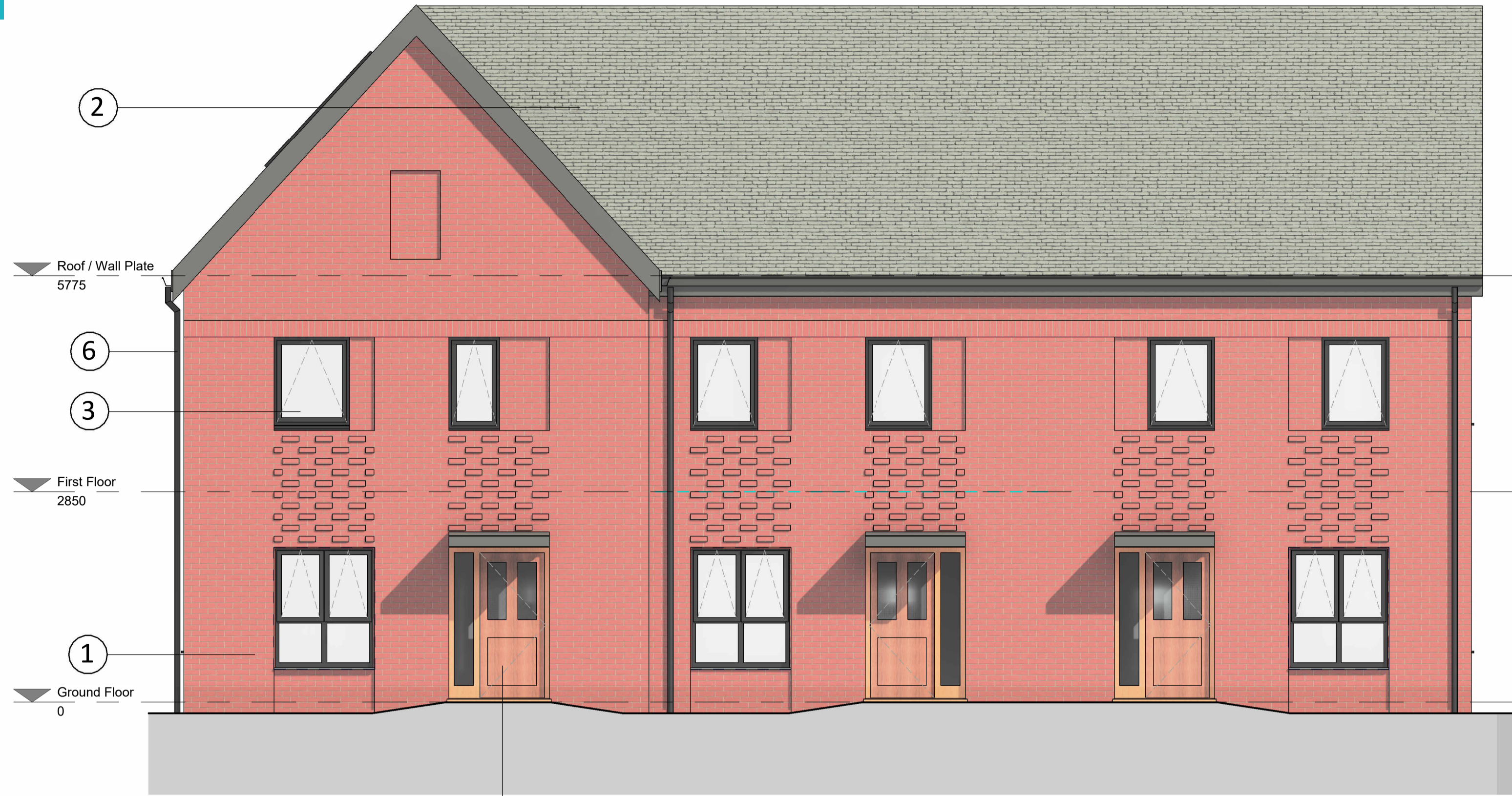
Front - North 1 : 50