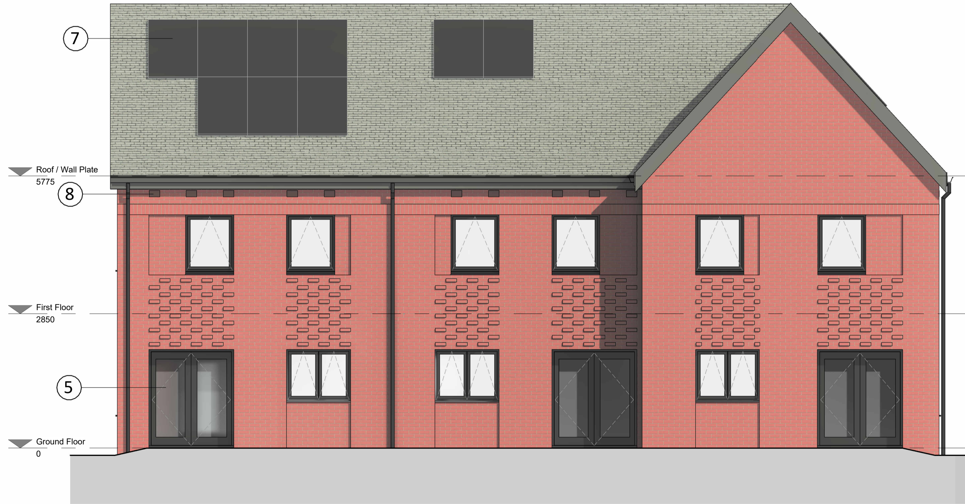
Rear - South 1 : 50