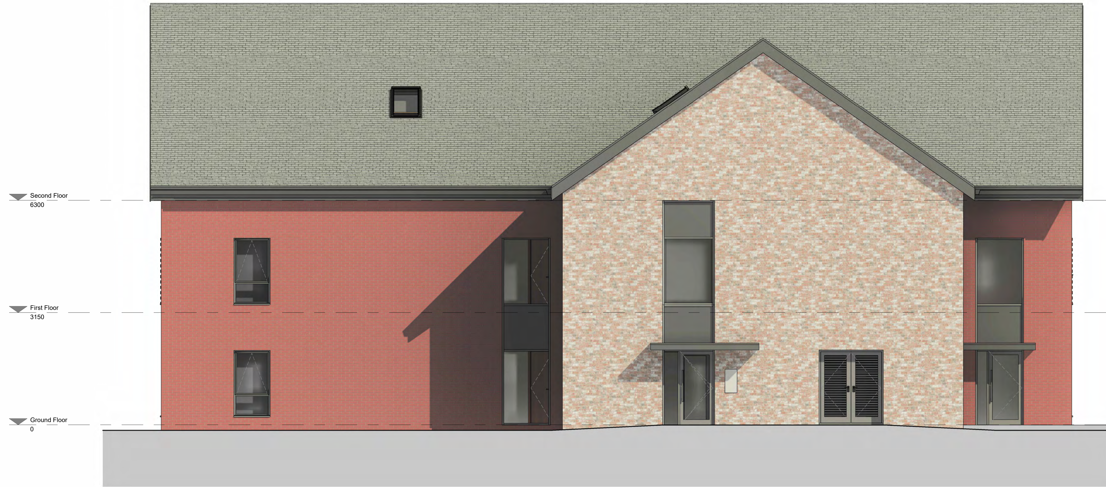
North 1 : 50