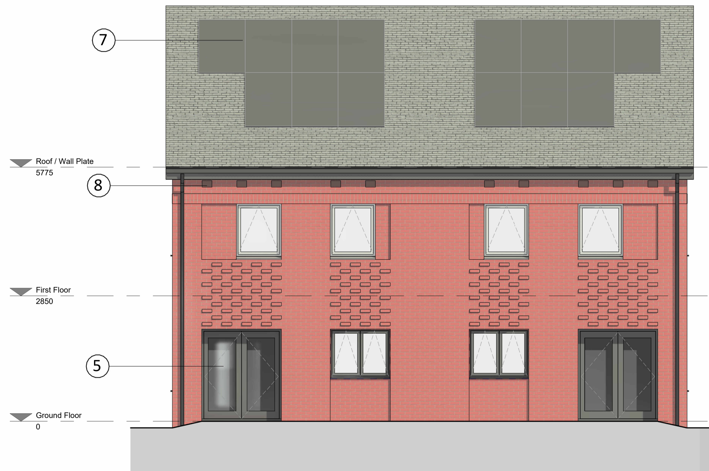
Rear - South 1:50