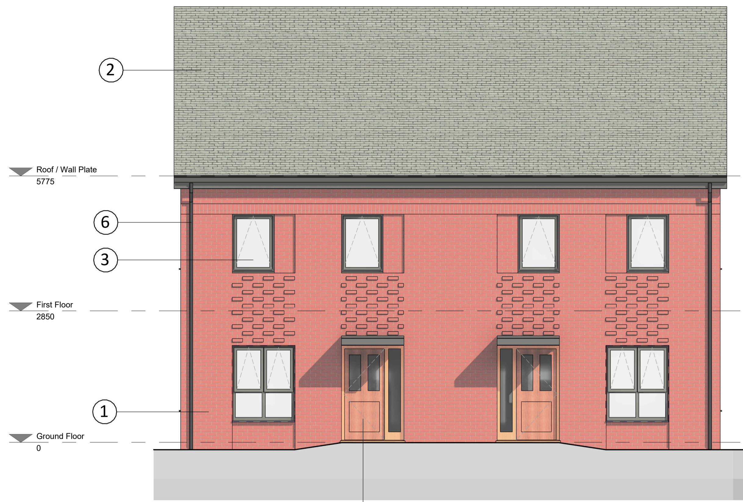
Front - North 1:50